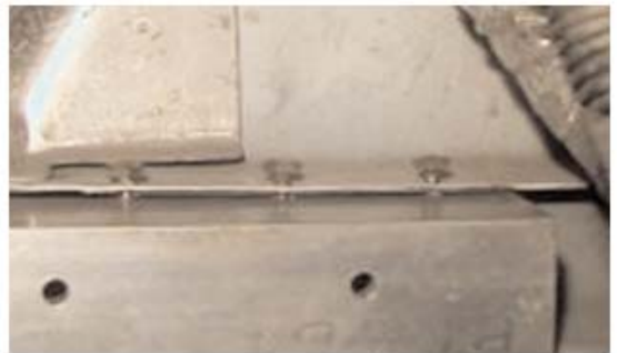
Drill and attach bolts through sheet metal lip and edge of angle. This will add support for mount.