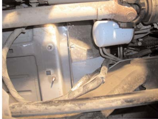
Remove heat shield