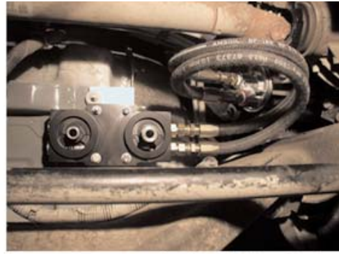
Replace old filter with spin on adapter Make up hoses and connect