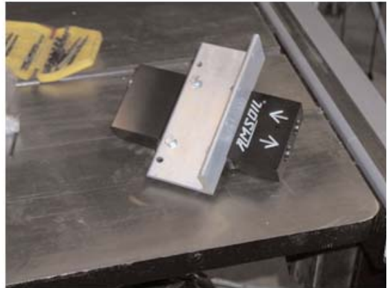
Use filter mount for template and drill holes