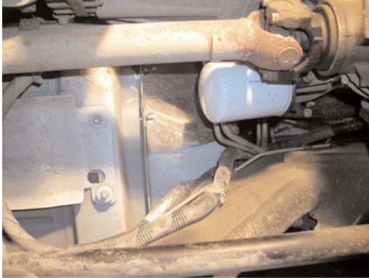
Stock filter location

AMSOIL Dual Remote By-Pass Filter System Submitted by Dealer Doug VanWingerden