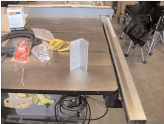
Cut angle iron for filter mount support