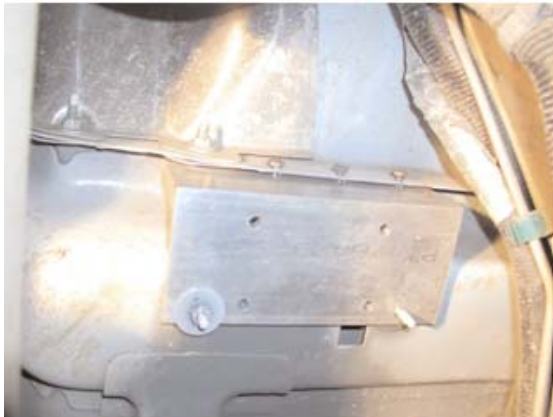
Attach angle to mount location, use existing stock bolts